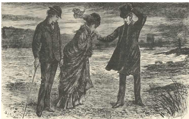
5. Mr. Crisparkle is overpaid

“Tut!” said the Minor Canon softly, “I am much overpaid!” and turned away.