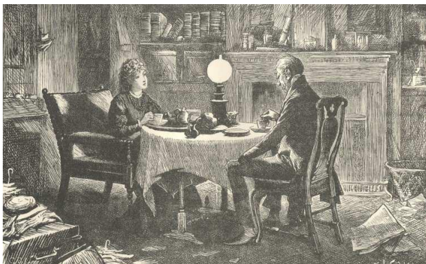
10. Mr. Grewgious experiences a new sensation

Rosa's expressive little eyebrows asked him what he meant?