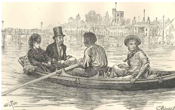
11. Up the river

“Cannot people get through life without gritty stages, I wonder?” Rosa thought next day, when the town was very gritty again, and everything had a strange and an uncomfortable appearance of seeming to wait for something that wouldn’t come. NO. She began to think, that, now the Cloisterham school-days had glided past and gone, the gritty stages would begin to set in at intervals and make themselves wearily known!