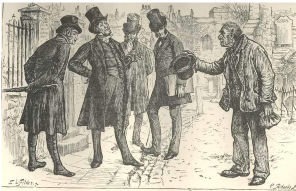
6. Durdles cautions Mr. Sapsea against boasting

“Don’t you get into a bad habit of boasting,” retorts Durdles, with a grave cautionary nod. “It’ll grow upon you.”