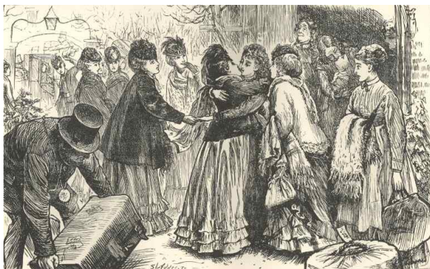
7. "Good-bye, Rosebud darling"

If Rosebud in her bower now waited Edwin Drood's coming with an uneasy heart, Edwin for his part was uneasy too. With far less force of purpose in his composition than the childish beauty, crowned by acclamation fairy queen of Miss Twinkleton's establishment, he had a conscience, and Mr. Grewgious had pricked it. That gentleman's steady convictions of what was right and what was wrong in such a case as his, were neither to be frowned aside nor laughed aside. They would not be moved. But for the dinner in Staple Inn, and but for the ring he carried in the breast pocket of his coat, he would have drifted into their wedding-day without another pause for real thought, loosely trusting that all would go well, left alone. But that serious putting him on his truth to the living and the dead had brought him to a check. He must either give the ring to Rosa, or he must take it back. Once put into this narrowed way of action, it was curious that he began to consider Rosa's claims upon him more unselfishly than he had ever considered them before, and began to be less sure of himself than he had ever been in all his easy-going days.