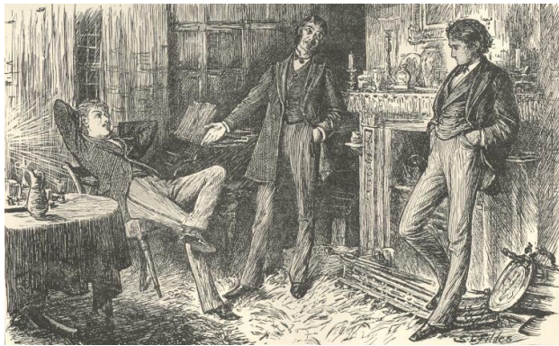
4. On dangerous ground

“Upon my soul, Jack,” says Edwin, complacently, “I feel quite apologetic for having my way smoothed as you describe. But you know what I know, Jack, and it may not be so very easy as it seems, after all. May it, Pussy?” To the portrait, with a snap of his thumb and finger. “We have got to hit it off yet; haven’t we, Pussy? You know what I mean, Jack.”