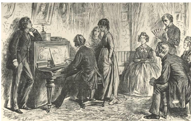
3. At the piano

eyes as well as hands; carefully and softly hinting the key-note from time to time. Standing with an arm drawn round her, but with a face far more intent on Mr. Jasper than on her singing, stood Helena, between whom and her brother an instantaneous recognition passed, in which Mr. Crisparkle saw, or thought he saw, the understanding that had been spoken of, flash out. Mr. Neville then took his admiring station, leaning against the piano, opposite the singer; Mr. Crisparkle sat down by the china shepherdess; Edwin Drood gallantly furred and unfurled Miss Twinkleton's fan; and that lady passively claimed that sort of exhibitor's proprietorship in the accomplishment on view, which Mr. Tope, the Verger, daily claimed in the Cathedral service.