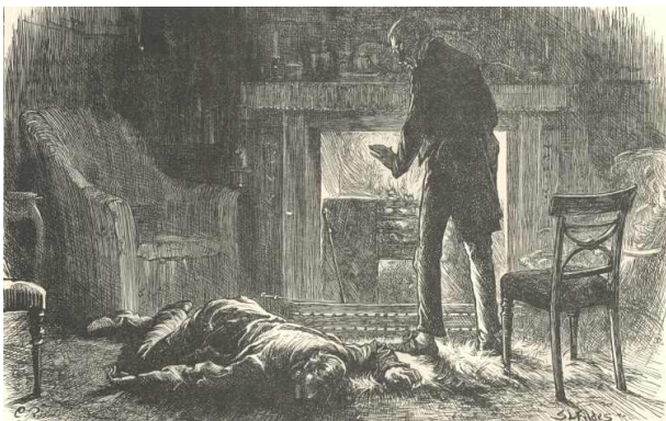
8. Mr. Grewgious has his suspicions