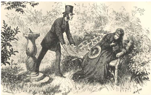
9. Jasper's sacrifices

“I mean to show you how mad my love is. It was hawked through the late inquiries by Mr. Crisparkle, that young Landless had confessed to him that he was a rival of my lost boy. That is an inexpressible offence in my eyes. The same Mr. Crisparkle knows under my hand that I have devoted myself to the murderer’s discovery and destruction, be he whom he might, and that I determined to discuss the mystery with no one until I should hold the clue in which to entangle the murderer as in a net. I have since worked patiently to wind and wind it round him; and it is slowly winding as I speak.”