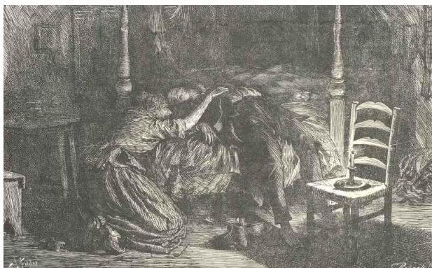
12. Sleeping it off

Once more he lapses into silence. Once more she lays her hand upon his chest, and moves him slightly to and fro, as a cat might stimulate a half-slain mouse. Once more he speaks, as if she had spoken.