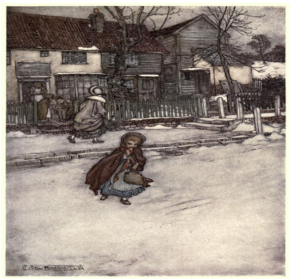
"Certain biscuit-bakers have gone so far as to imprint his likeness on their New-Year Cakes."