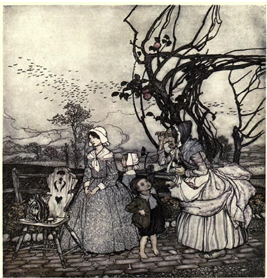
"These mountains are regarded by all good wives, far and near, as perfect barometers."