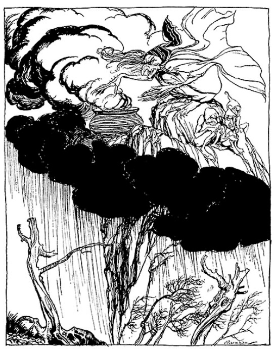
When these clouds broke, woe betide the valleys!

in gentle showers, causing the grass to spring, the fruits to ripen, and the corn to grow an inch an hour. If displeased, however, she would brew up clouds black as ink, sitting in the midst of them like a bottle-bellied spider in the midst of its web; and when these clouds broke, woe betide the valleys!