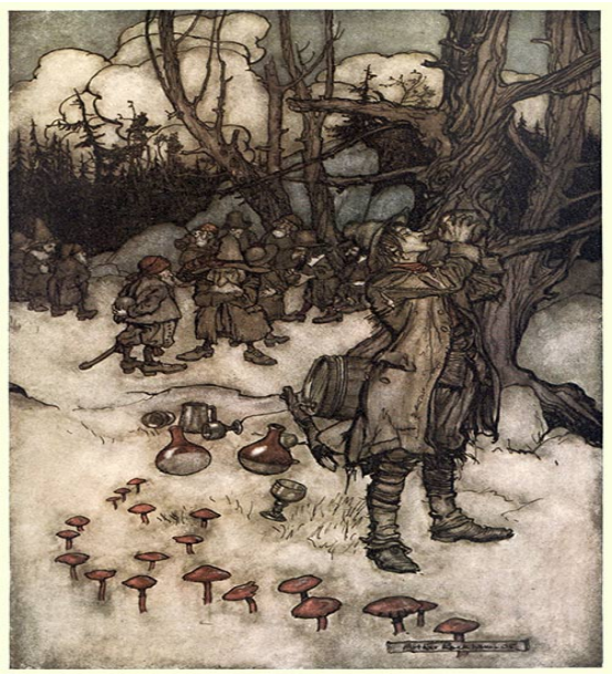
"He even ventured to taste the beverage, which he found had much of the flavour of excellent Hollands."