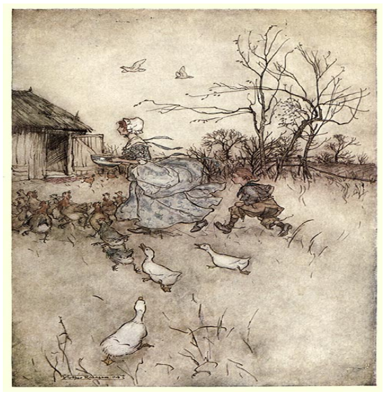
"Equipped in a pair of his father's cast-off galligaskins, which he had as much ado to hold up as a fine lady does her train in bad weather."