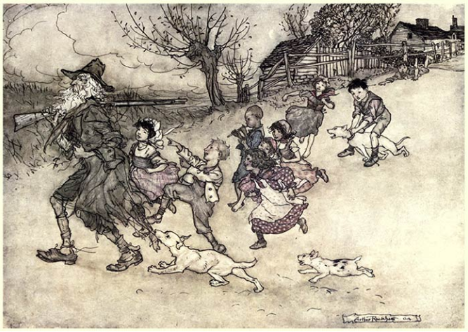
"A troop of strange children ran at his heels, hooting after him and pointing at his grey beard."