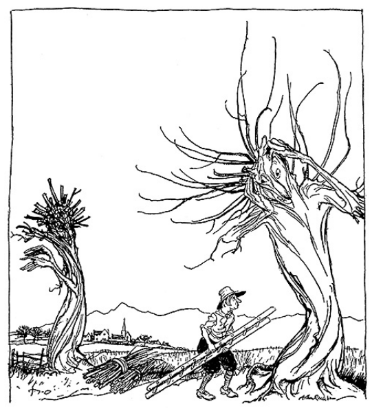
Very subject to marvellous events and appearances.