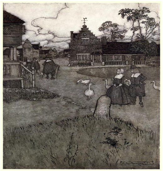
"Some of the houses of the original settlers."