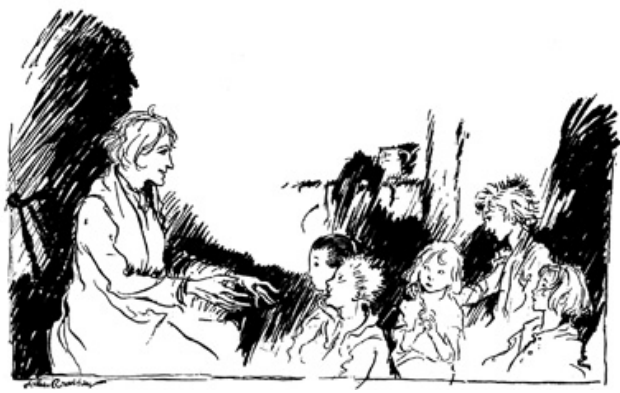
Long stories of ghosts, witches, and Indians.

The great error in Rip's composition was an insuperable aversion to all kinds of profitable labour. It could not be for want of assiduity or perseverance; for he would sit on a wet rock, with a rod as long and heavy as a Tartar's lance, and fish all day without a murmur, even though he should not be encouraged by a single nibble. He would carry a fowling-piece