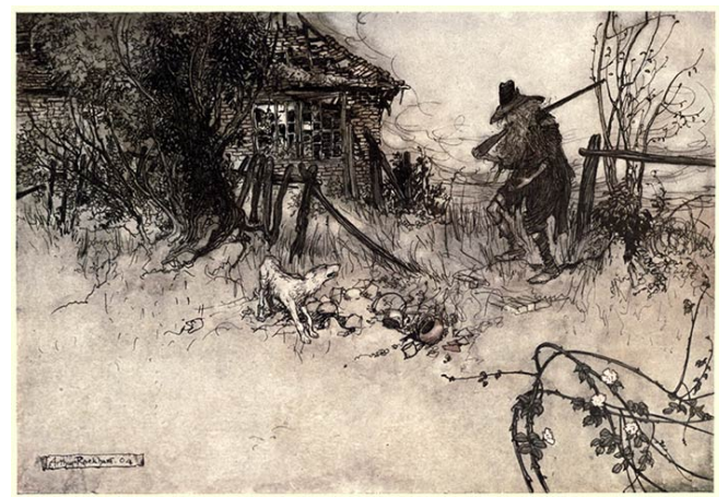
"He found the house gone to decay.... 'My very dog,' sighed poor Rip, 'has forgotten me.""