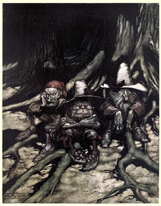
"They maintained the gravest faces."