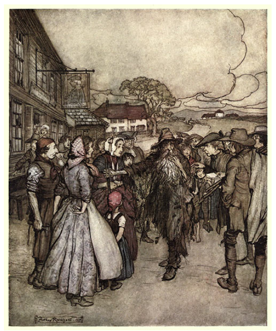
"They crowded round him, eyeing him from head to foot with great curiosity."

It was with some difficulty that he found the way to his own