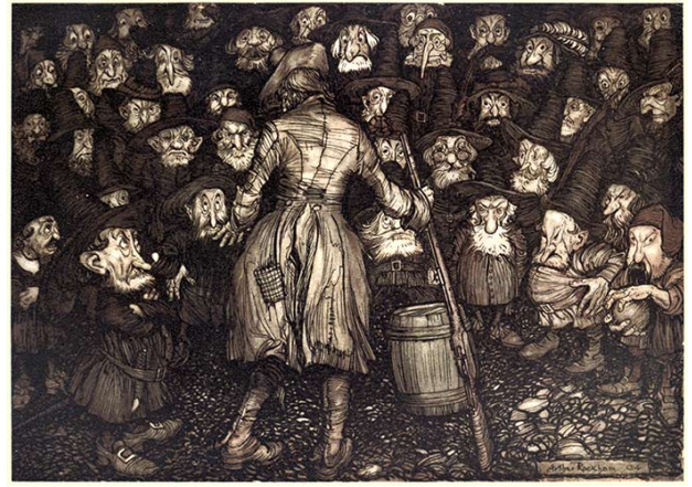
"They stared at him with such fixed, statue-like gaze, that his heart turned within him and his knees smote together."