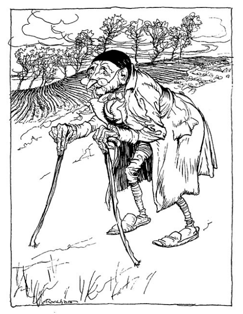
Peter was the most ancient inhabitant of the village (p. 24).

The bystanders began now to look at each other, nod, wink significantly, and tap their fingers against their foreheads. There was a whisper, also, about securing the gun, and keeping the old fellow from doing mischief, at the very suggestion of which the self-important man in the cocked hat retired with some precipitation. At this critical moment a fresh, comely woman pressed through the throng to get a peep at the grey-bearded man. She had a chubby child in her arms, which, frightened at his looks, began to cry. "Hush, Rip," cried she, "hush, you little fool; the old man won't hurt you." The name of the child, the air of the mother, the tone of her voice, all awakened a train of recollections in his mind. "What is your name, my good woman?" asked he.