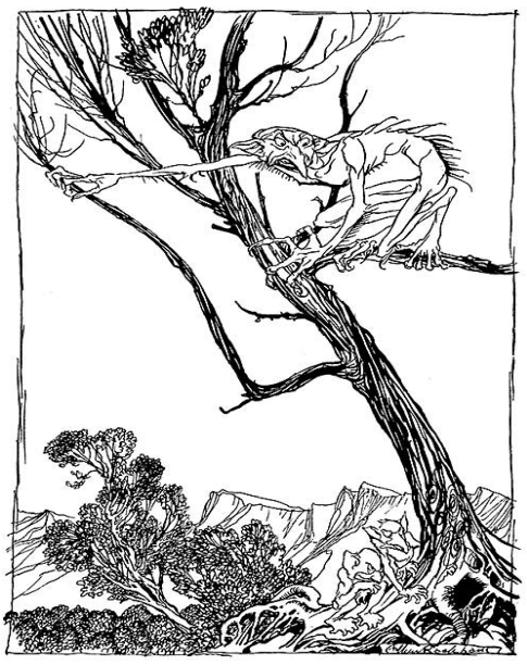
The Kaatskill mountains had always been haunted by strange beings.