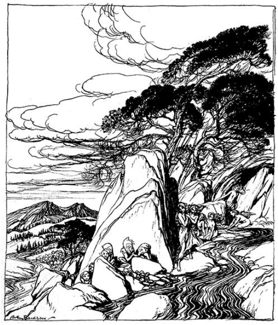
These fairy mountains.