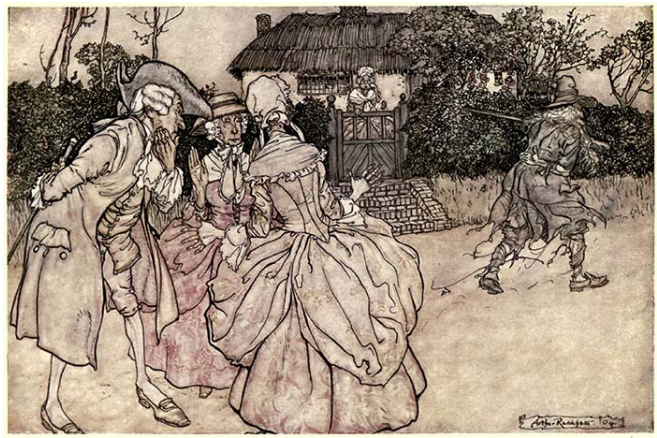
"They all stared at him with equal marks of surprise and invariably stroked their chins."