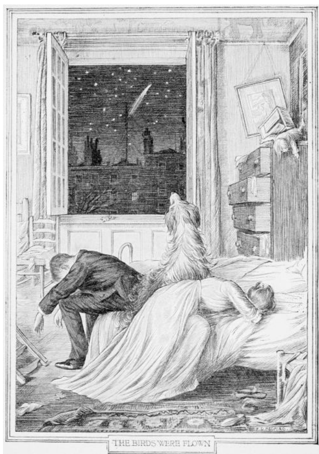
THE BIRDS WERE FLOWN

Mr. and Mrs. Darling and Nana rushed into the nursery too late. The birds were flown.