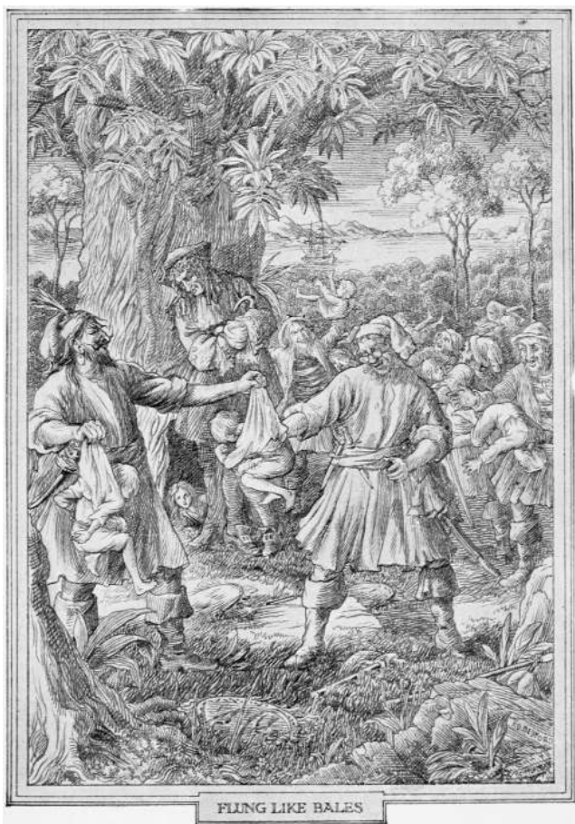
FLUNG LIKE BALES

A different treatment was accorded to Wendy, who came last. With ironical politeness Hook raised his hat to her, and, offering her his arm, escorted her to the spot where the others were being gagged. He did it with such an air, he was so frightfully distingué , that she was too fascinated to cry out. She was only a little girl.