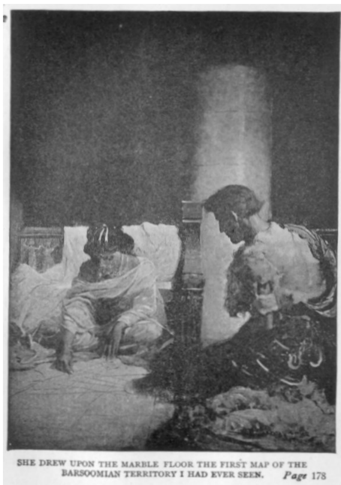
SHE DREW UPON THE MARBLE FLOOR THE FIRST MAP OF THE BARSOOMIAN TERRITORY I HAD EVER SEEN. Page 178

Finally, after studying the map carefully in the moonlight which now flooded the room, I pointed out a waterway far to the north of us which also seemed to lead to Helium.